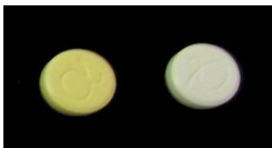
Figure 2: Colouration of frusemide tablets after eight weeks of exposure to fluorescent light showing the exposed side of the tablet (left) and the bottom unexposed side of the tablet (right).

Prochlorperazine is a phenothiazine drug, widely used as an anti-emetic and is susceptible to oxidation to sulphoxide (a metabolite and a photodegradant) under the influence of light. The main metabolites and degradants of all phenothiazines are found to be inactive at the dopamine receptors. This, and the fact that prochlorperazine is reported to cause photosensitivity effects in patients, prompted an investigation into its repackaging into DAAs. 26, 27