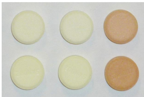
Figure 4: Photographic comparison of the colour of clozapine tablets from left to right: control, sample packed six weeks under simulated real conditions, and left out of packaging exposed to light and air on the bench (Clopine above and Clozaril below).

The results shown in Figure 4, illustrate an extreme discolouration for the exposed tablets very similar to the anecdotal reports from practice. This result thus shows that clozapine, when correctly repackaged, maintained its physical and chemical stability for six weeks. Based on these further studies it is assumed that these reports were as a result of improper handling of these DAAs by patients. These findings highlight the importance of the role of the pharmacist providing patient care in advising on the correct handling and storage of their DAAs.