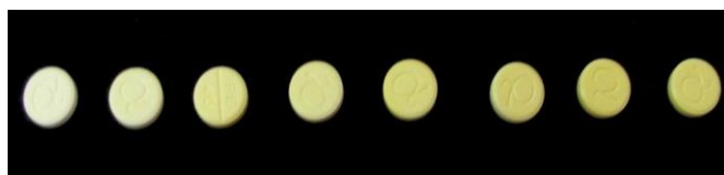
Figure 1: Progression of colouration of frusemide tablets exposed to fluorescent lighting over an eight week period from left (week 1) to right (week 8)

exposure to light in the pharmacy and under ICH conditions, even after one week resulted in a yellow colouration of the tablets. The progressive yellow discolouration of the tablets over an eight week storage period (Figures 1 and 2) was attributed to exposure to fluorescent lighting, which was not encountered under the 'home-conditions'. Although the colour change was noted as having negligible effects on the drug content and other physical parameters, such as dissolution of the tablets, it was considered an unacceptable change, since patients are likely to be concerned about a possible compromise in the quality of the medication, and this may have an adverse effect on patient acceptance and hence adherence.