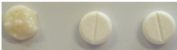
Figure 3: Appearance of sodium valproate tablets after 21 days of storage at accelerated (40°C; 75% RH) (left), refrigerated (2–8°C) (middle) and controlled room temperature (25°C) (right) conditions.

Sodium valproate Recently Llewelyn and colleagues 6 undertook a study on the stability of sodium valproate repackaged into DAAs and stored under various temperature and humidity conditions. The results of this study highlight the importance that accelerated conditions of temperature and humidity be taken into account, and that cognisance is taken from the fact that in different countries, and in fact within the same country, the climatic conditions might vary considerably. Medication therefore may be appropriately for repackaged in, for example, a temperate region such as London, Los Angeles or even Sydney, but repackaging that same medication in tropical or desert regions such as Darwin or Dubai may be completely inappropriate due to increased heat, humidity and light conditions. The results revealed that while the sodium valproate content in the tablets remained within an acceptable range under all storage conditions for eight weeks, the physical stability was not maintained, with unacceptable weight variation in the tablets, changes in their dissolution profiles and significant changes in their appearance, under accelerated conditions, due to the hygroscopicity of the API even after only three weeks (Figure 3). These results are significant because these accelerated conditions are not uncommonly encountered in northern Australia and other tropical regions worldwide.