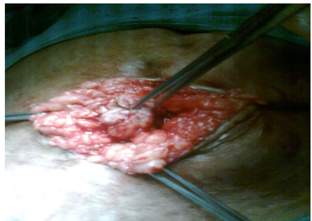
Fig.1 Encapsulated mass surrounded by pale subcutaneous tissue on laparotomy (Endometriotic mass)

A 31 years old Para 1+0 was having pain and swelling of lower abdomen below umbilicus in the midline for last 2 years. She was taking treatment from private practitioner but was not getting any relief; instead the swelling was progressively increasing in size. The patient was referred to the general surgeon for the swelling where the diagnosis of stitch granuloma or lipoma was made. The patient was also referred to our gynaecological outpatient department for the dysmenorrhoea. On taking thorough history, she revealed that there was swelling in the abdominal scar of caesarean section which was performed eight years back increases and become painful during menses. On examination there was a firm tender mass of 4cm × 3cm in the vertical midline scar of her previous caesarean section. The diagnosis of scar endometriosis was made on the clinical ground. The patient was put on danazol 100mg twice daily for 3 month the pain, however the swelling persisted. Finally a surgery was planned after treatment of 3months of danazol. The mass was confined to the subcutaneous tissue (Fig.1).