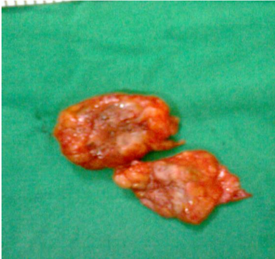
Fig 2: Excised endometriotic tissue