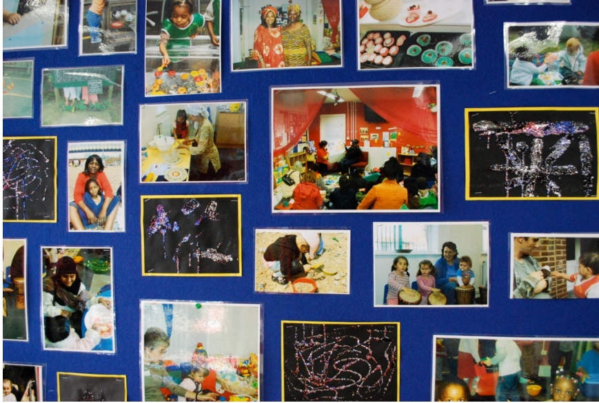
Figure 3. Capturing observations as part of research during Discover for the NHS Perinatal Mental Health project