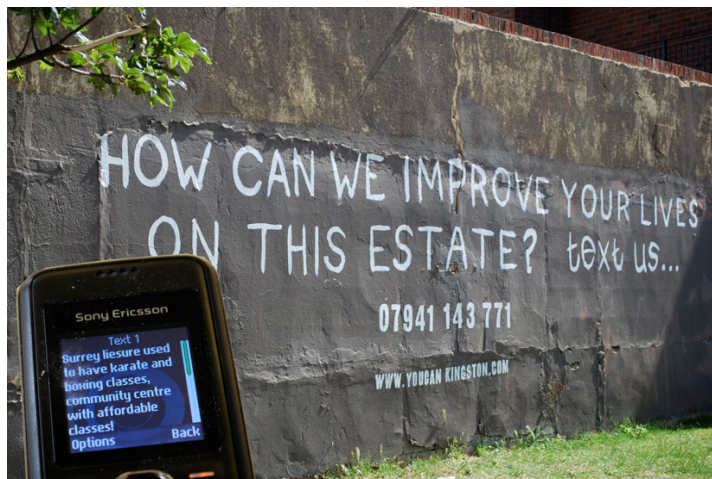
Figure 2. Guerilla murals and text messaging used during the Engage stage of the YouCanKingston project