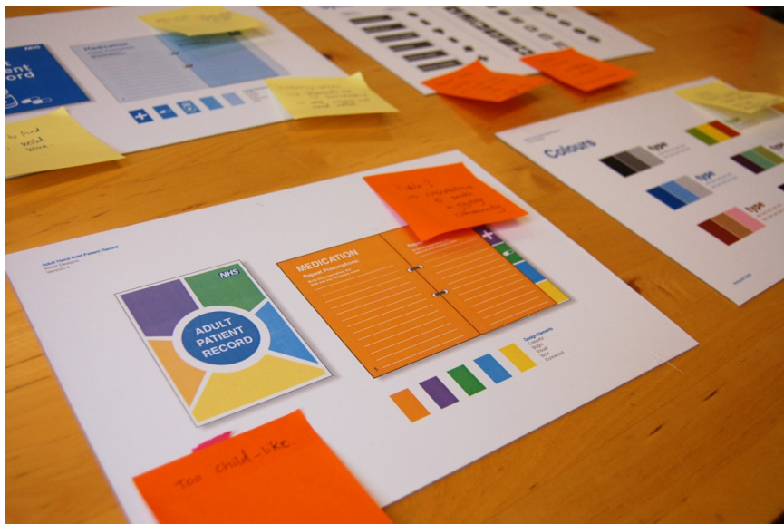
Figure 4. Prototypes used in Develop and Test of paper-based health records for gypsy and traveler communities