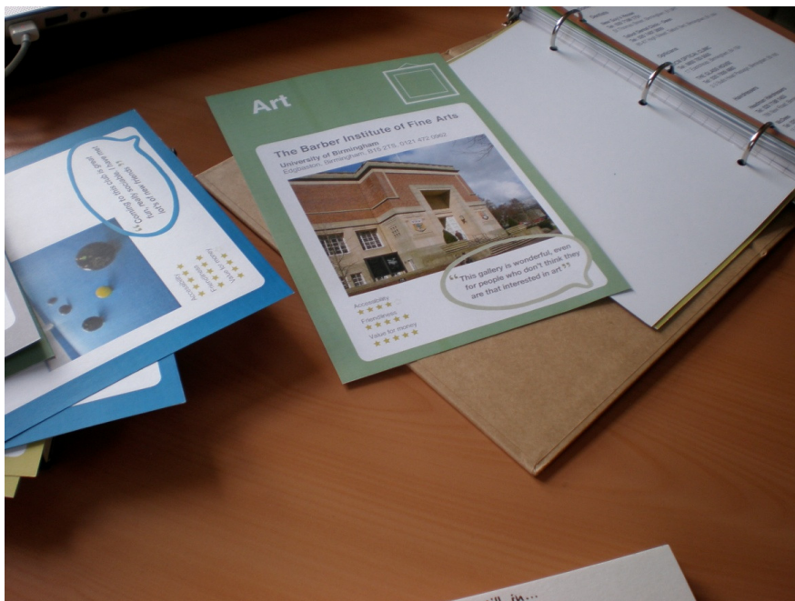
Figure 6. Developing the Dementia Advisors service handbook and folder during Influence, Deliver and Enterprise