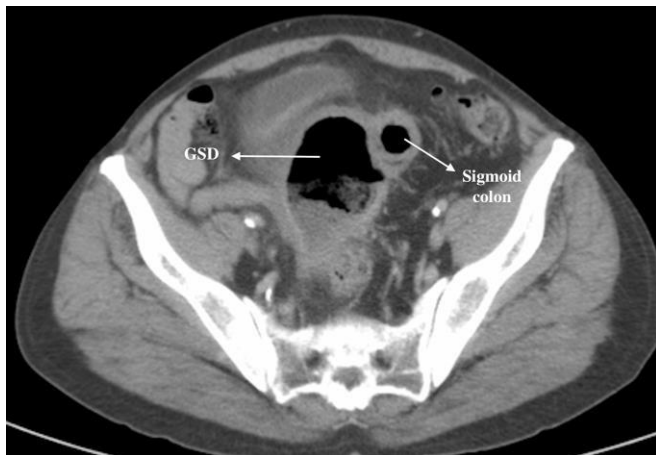
Figure 1: A thick-walled collection to the right of the sigmoid colon

This “collection” appeared to have a large opening into the sigmoid colon (Figure 2). The differential diagnosis at this point was a large pelvic abscess secondary to a perforated sigmoid diverticulum, bowel duplication, Meckel’s, or duodenal diverticulum. A barium enema study clearly demonstrated the 6cm diameter giant diverticulum located to the right of the sigmoid colon (Figure 3).