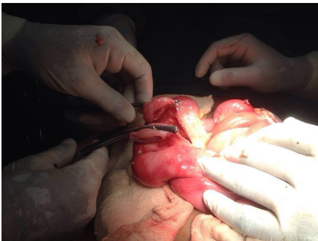
Figure 1: Transected loop of jejunum ileal junction in the supracolic compartment

There was no evidence of malrotation of the gut. All the infected peritoneal fluid was evacuated. The ruptured loop of the jejunum ileal junction was easily reduced back to the infracolic general peritoneal cavity. After reduction, the rent in the middle of the transverse mesocolon was inspected and found to be congenital in nature with thickened intact margins (Figure 2). Primary end-to-end anastomosis of the small intestine was done along with closure of the defect in the transverse mesocolon with 1-0 vicryl. The abdomen was closed in layers with bilateral tube drains after thorough peritoneal toilette. The postoperative period was uneventful with the usual postoperative orders. He was discharged on the 11 th day post-operation.