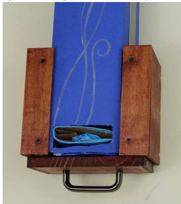
Figure 4: Modified glove box with front-side perforation

As glove pucks are removed, gravity slides the next one into place at the orifice. The cost of creating the alternate form of the dispensing unit is minimal, since the only purchase needed is the sleeve and box without the drawer-pull. This modified design could still assist in the prevention of contamination from handling; however, it would expose the gloves to any airborne contaminants.