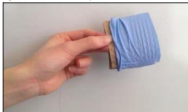
Figure 1: Glove shown on puck scaffold

Once the dispensing unit is mounted on the wall, the perforation on the bottom of the box is torn so that the gloves can be dispensed. At the bottom of the wall mount, there is a spring-loaded pull-down drawer mechanism that allows the user to open the container just wide enough to obtain one glove puck by pulling the handle down (Figure 2). The pull-down drawer automatically closes due to the spring-loaded apparatus before any more gloves are exposed to air or touch. This gives the user easy access to the dispensed gloves. The puck-like scaffold that holds the gloves allows the user to slip his/her hands through the scaffold into the gloves with ease (Figure 3). The scaffold is simply disposed of or recycled afterward, depending on the setting.