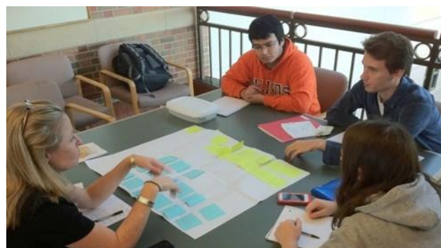
Figure 2: Bioengineering students brainstorming the 'bathroom of the future'

These students were encouraged to explore conceptual ideas through rough sketch modelling techniques. This form of quick visualisation helps to illustrate product opportunities as well as conceptual flaws at very early stages, as well as throughout the course of a project. Figure 3 shows this rapid form of communication using cardboard and other 'found' materials to illustrate how sensors on a toothbrush might measure blood oxygen, blood pressure and pulse, or how a shelf in a toilet could weigh and photograph faecal matter.