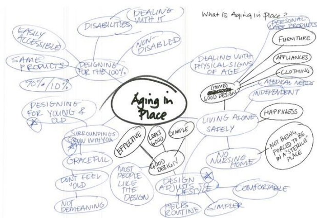
Figure 8: Students created mind maps to illustrate ‘Aging in Place’ from their own perspectives (as 20 year olds).

Using brainstorming techniques, students explored daily tasks of a range of various age groups. Employing empathic modeling techniques (e.g. homelessness, limited mobility, healthy eating), they identified key problems and potential solutions such as: