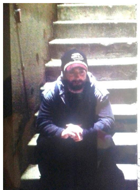
Figure 9: Design student warming in the sun as he used empathic modelling to explore what it was like to be homeless.

One of the students used empathic modelling to experience ‘homelessness’ by spending 18 hours outside in cool and damp weather, without money, shelter, sustenance or a mobile phone. His discomfort was captured in Figure 9 as he attempted to dry himself in the sunshine after a rain shower. He reported that this simple exercise has had a strong and lasting emotional impact on him. Being disconnected from family and friends was disconcerting. Over the course of his modelling, his sense of dignity was being eroded as he recognised that people crossed the road to avoid him.