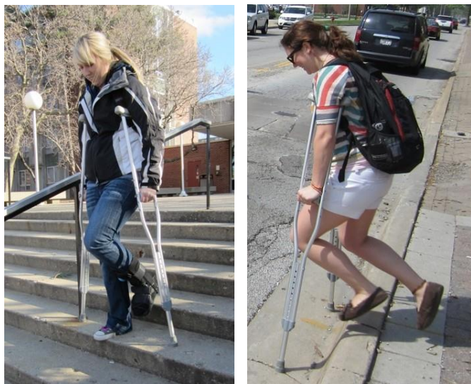
Figure 4: Students conducting empathic modelling in order to gain intimate insight and understanding into the experience of using a crutch.

Guided by design and engineering professionals, these students are focusing on simple and potentially patentable modifications to auxiliary parts to ‘standard’ crutches available in the USA to improve the user experience.