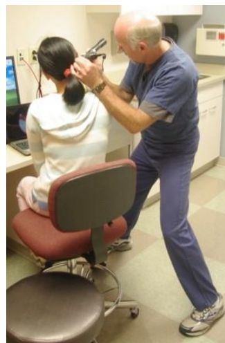
Figure 5: Ethnographic observation of authentic human behaviour: Clinician demonstrating how he uses otoscope.

The engineers built a proof of concept model of a high-resolution data imaging laser otoscope in their laboratory from standard off-the-shelf parts. Their focus was on designing and proving the technology, whilst the designer’s challenge was to translate and transform this model into a device that resonates with the final user considering human interaction and engagement (refer to Figure 6).