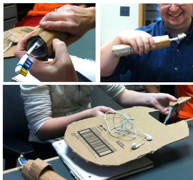
Figure 3: Illustrates initial early stage ideas in three-dimensional sketch models

These students were encouraged to explore conceptual ideas through rough sketch modelling techniques. This form of quick visualisation helps to illustrate product opportunities as well as conceptual flaws at very early stages, as well as throughout the course of a project. Figure 3 shows this rapid form of communication using cardboard and other 'found' materials to illustrate how sensors on a toothbrush might measure blood oxygen, blood pressure and pulse, or how a shelf in a toilet could weigh and photograph faecal matter.