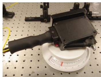
Figure 6: (a) Engineering proof of concept device, (b) ergonomic studies through rapid sketch modeling and (c) form visualisation.

The engineers built a proof of concept model of a high-resolution data imaging laser otoscope in their laboratory from standard off-the-shelf parts. Their focus was on designing and proving the technology, whilst the designer’s challenge was to translate and transform this model into a device that resonates with the final user considering human interaction and engagement (refer to Figure 6).