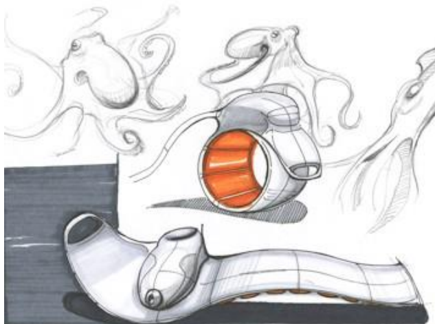
Figure 7: Concept exploration and visualisation sketch.