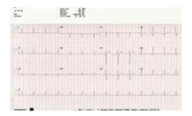
Figure 5: The ECG taken after PTCA and stenting shows normalisation of the biphasic T waves in leads V2, V3 and V4.

Such changes if present in an asymptomatic patient, require immediate management. Wellens' syndrome is thought to be due to reperfusion of the ischaemic myocardium. It has been studied in various case series, with the conclusion that if left untreated, patients would eventually develop extensive anterior myocardial infarction with cardiac failure or sudden death. The treacherous point in this syndrome is that during the pain, the T wave changes (grade 1 ischaemia) may be subtle and easily missed, while glaring T wave changes do occur during the pain-free interval. These are liable to be missed as the ECG may not be repeated during that asymptomatic period. By comparing the T wave changes in this patient at initial presentation as, 24 hours later and post-stent, one can see that a high index of suspicion and ECG reading skill is required to catch this catastrophic syndrome at the earliest (Figure 6).