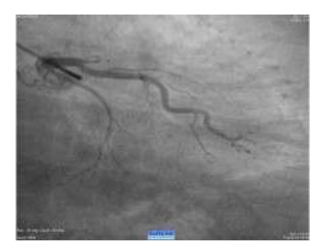
Figure 4: A still from the CAG showing normalisation of flow in the LAD post PTCA.

Figure 3: A still from the CAG shows 100% block in the proximal LAD artery due to a thrombus, indicated by the arrow mark.