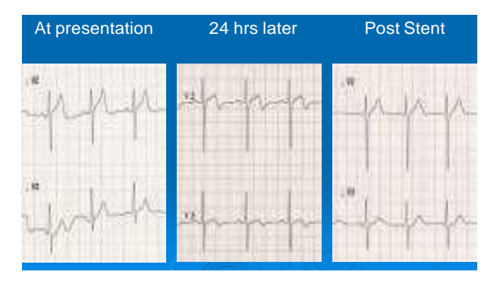
Figure 6: Comparison of the ECGs taken during the chest pain, during the pain-free interval and post-stent placement.

indicated that 75% of the subjects who did not undergo revascularisation developed anterior wall infarction within a few weeks. Hence, this classical ECG pattern later came to be known as Wellens' Syndrome. In a second study by de Zwaan and Wellens conducted in 1989 on anginal patients with this pattern on the ECG, all patients were found to have significant proximal LAD disease.<sup>3</sup>