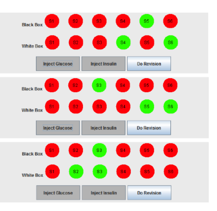
Figure 3: Snapshot of a part of the interface for the diabetes patient causal model application. The topmost figure shows the initial states of the black box (S5) and white box (S4, S6). The middle figure shows the transition states after administering glucose: (S3) and (S4, S6). The bottom-most diagram shows the transition states after the agent performs a revision operation

states S5 ( normal, not alert ) and S3 ( high, alert ) is 2 because these states differ in two propositional variables. A snapshot of a part of our implementation in Java of the diabetes example is shown below in Figure 3.